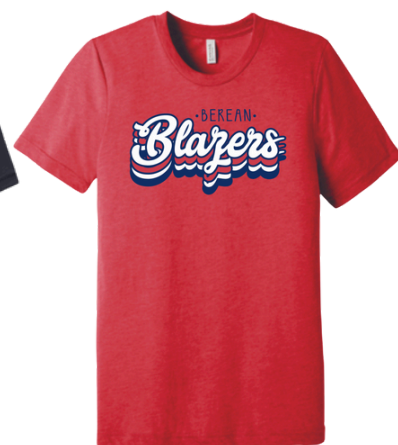
Field Trip Shirt (required)